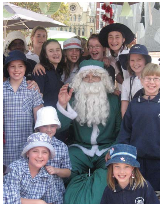
Roxburgh Park Primary School students meet Green Santa at Green Christmas 2006

The concept of the Green Christmas is to reinforce the message that everyone can play a part in reducing the effects of climate change on the environment for future generations. Themes on water and the impact of the drought provided the opportunity for schools to win a 13,500 litre water tank, which was organised by Mitre 10 and Nylex as part of their sponsorship of the event. Other water conservation and savings items were provided as prizes during the week and were eagerly sought after by schools and the general public.