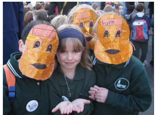
Visiting students proudly display their worm masks and racing entries

Activities included: Worm Racing; Mr/Ms Wormiverse Beauty Pageant; Worms on Plates (worm anatomy); Wormy Face Painting; roaming Worm Puppets; Green Handball and more. Prizes included Bokashi home composting bins from eco organics. The event featured on The Age online, MX magazine and Channel 10.