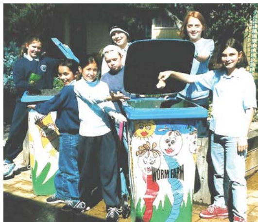
Gould's long-running Waste Wise Schools Program continues to win prestigious awards