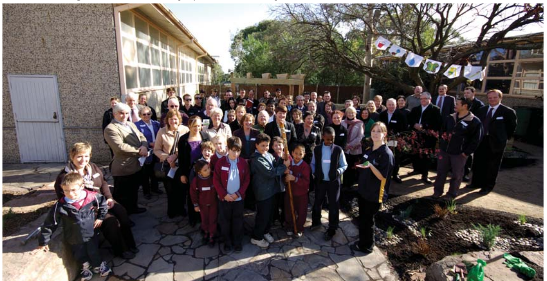
Funding and project partners joined Gould Board and Members and other visitors and guests at the opening of the Climate Change and Water Wise Demonstration Garden

This major educational features include: innovative tank use; demonstration grey water recycling; mini sports oval demonstrating subterranean drip irrigation and drainage to slab water tanks and drought tolerant turf options for ovals; water efficient hydroponic system; creek bed feeding to the wetland with run off from roofs; water tanks and subterranean dripper irrigation systems feeding garden beds; stormwater capture and reuse; solar water pumps; a weather station; and a range of other demonstration features. The garden was officially opened on 30 May 2007.