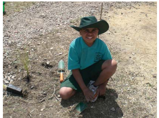
Rosewall Primary School students get busy planting their new gardens