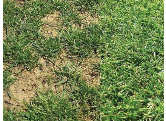
Tough water restrictions due to extreme drought conditions have forced many sporting organisations and schools to close their ovals

Gould and its technical partner GPS delivered a water sustainability audit, assessment, action plans, benchmarking and recommendations to ten Victorian AFL clubs to achieve above the minimum 25% water reduction required to continue irrigating competition and training grounds. This scoping project has led to further education and consultancy work within these - and other - sporting clubs to create excellent water saving outcomes in the clubs themselves and provide valuable community models. We look forward to continuing our association with the AFL and its member clubs in addressing the water and other sustainability issues.