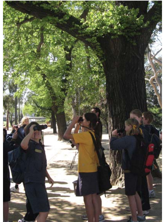
Children enjoy birdwatching by the Yarra at the Pledge Launch Day