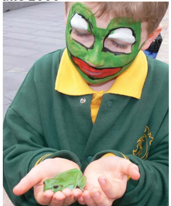
A keen frog admirer at the Gould Group Frog Day

World Environment Day provided Gould Group with a special opportunity to focus on the important role that frogs play in protecting the environment by providing early warning of problems, such as stream pollution. Frogs are a major environmental icon and, because of their appeal to children, provide a major avenue to promote environmental education and community awareness of green issues.