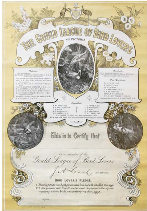
The 1909 Gould League Pledge - bringing history to the future with our online sign up service

It was also part of a strategy to reconnect with our former members - the parents and grandparents who learnt about bird conservation at school.