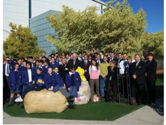
Staff and students at St Monica's College join Gould Group representatives and project partners at the Enterprise Schools launch

"At the end of this project, teachers reported a significant increase in the inclusion of sustainability in their everyday teaching practices. This is a significant outcome for this project and wider field of environmental education. The Enterprise Schools project allowed the participating schools to develop an effective model for enterprise learning in the context of real community issues. Through working with the Gould Group and FM Recycling, students were engaged and able to build strong links with local businesses, industry and the community."