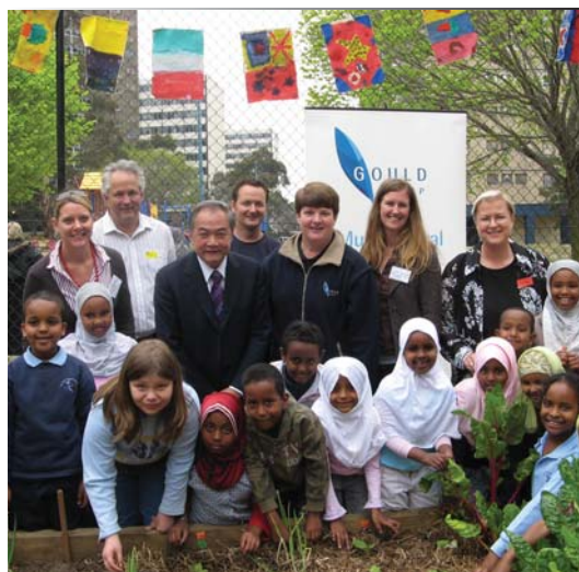
Lord Mayor of Melbourne, Cr John So joined Gould Group in celebrating the Multicultural School Gardens Harvest Festival at Carlton Primary School