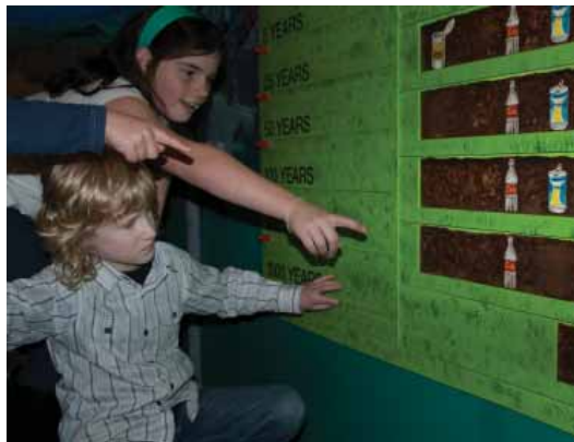
"I was amazed at how long rubbish takes to break down. I learned lots." Year 2 student

Compost Capers – a fun-filled exploration of how to make great compost, how composting works and the important jobs that compost creatures have.