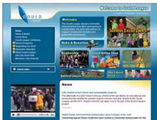
The Gould League website continues to be a popular and important portal for Australian environmental education resources.