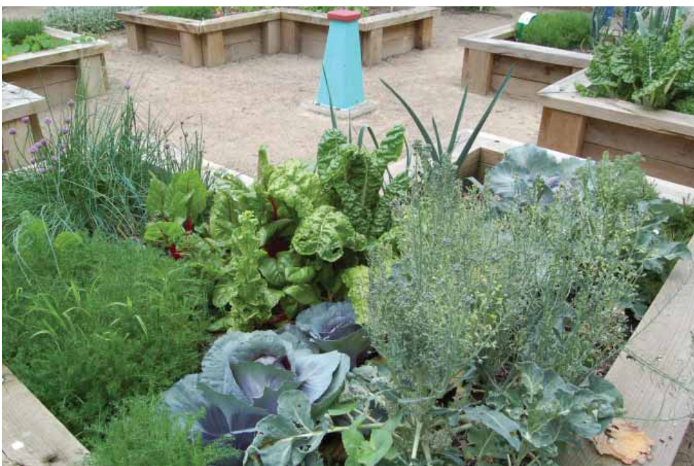
The Gould League Climate Education Garden Vegetable Patch ready for harvest