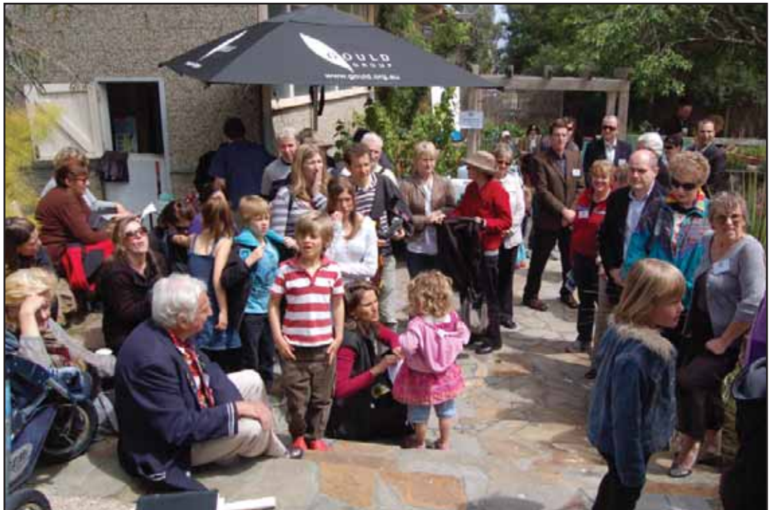
Visitors and guests enjoying the Gould League Centenary Muster in our Sustainability Education Centre Garden.

Its principal activities involve environmental education, curriculum consultancy, training, sustainability consultancy services, running a range of school programs, community activities and raising funds to support our programs and initiatives.