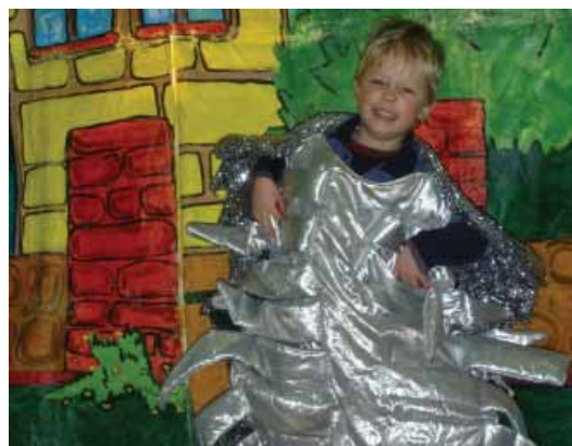
"I had a very very fun time. My favourite part of the time we were there was when I could dress up as a Christmas beetle." Year 2 student