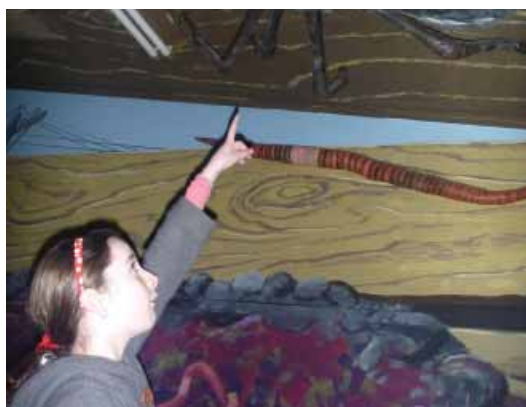
"I loved it when we shrank into the compost. It was really really fun." Year 2 student